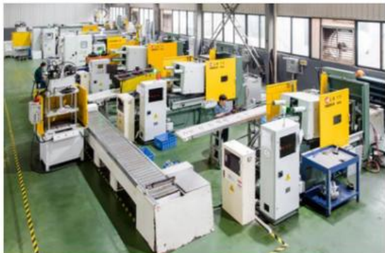
Workshop photos: Aluminum & zinc alloy die casting workshop